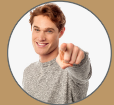
YOU. ...YES, YOU!

Community members can download the app from the Apple App Store or Google Play and stay informed of new events and programs in our community.